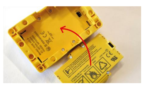
Figure 6: How to insert the battery

The battery (fig 5) . This part is inserted inside of the main hub. (see fig 6.) It powers the electronics and is replaceable if needed. The battery charges when the hub is connected to power by USB.