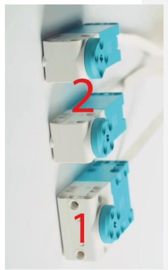
Figure 7: The two types of motors